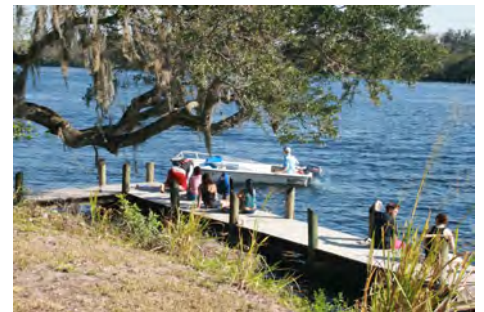
Replacing the Alva boat ramp dock is a major maintenance project included in Lee County's budget for the 2015-16 year.

County commissioners talked about the projects Sept. 1 during their budget workshop. They decided, among other