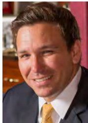
Andrew Gillum vs. Ron DiSantis Governor