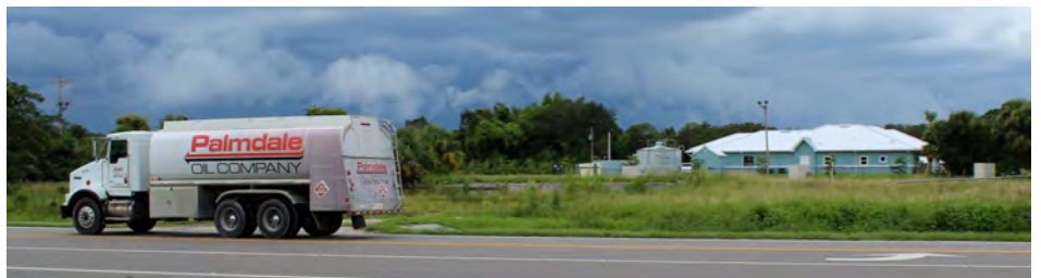
An oil truck rolls by the site of a proposed 7-11 convenience store with eight gas pumps.