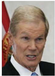
Rick Scott vs. Bill Nelson U.S. Senate